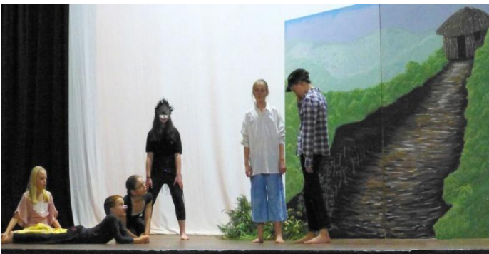
Above: The cast (missing is the Narrator).