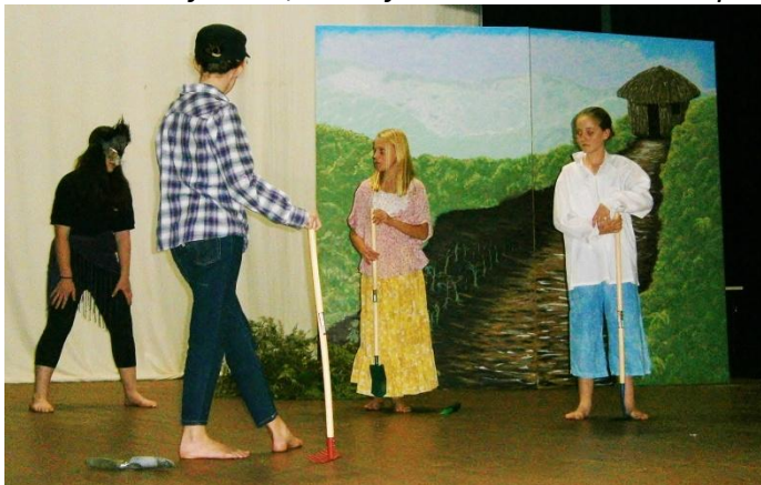
Below: The farmer, his wife and son meet the Imp

The Bean Skit was next on the programme followed by Outwitting the Imp .