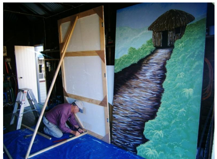
Above: Paul attaching frames to scenery flats.

VHP are now accepting applications for new students for Term 3 and further information is available on VHP's website or you can email us. Both addresses are below.