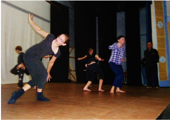
Above: Trying to walk through thick jungle.

The Bean Skit was next on the programme followed by Outwitting the Imp .