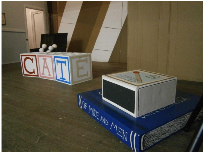
Look at the detail in the box of matches and book. Well done, Eden!